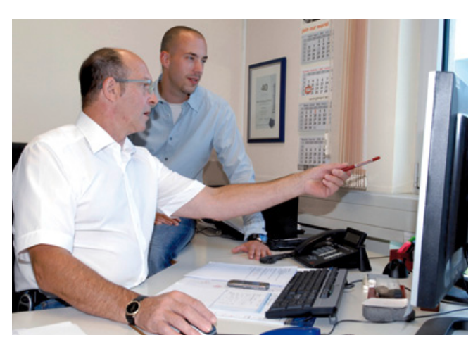
Experience pays off: Our staffers competently and reliably advise our clients

Our team members can be contacted by telephone, fax, e-mail or with a specific spare parts inquiry via our home page.