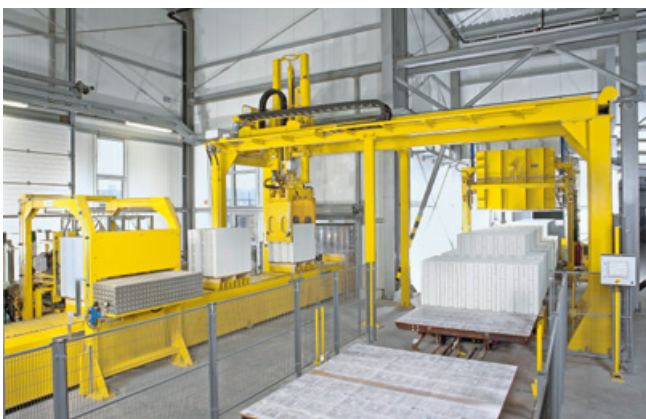
From hardening car to packaging plant: Efficient and appropriate for the material