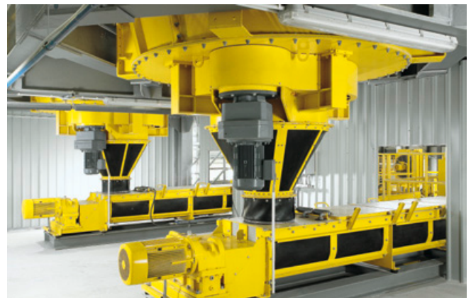
Lower part of reactor with double shaft mixer