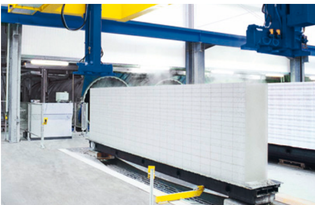
Filling of the autoclaves