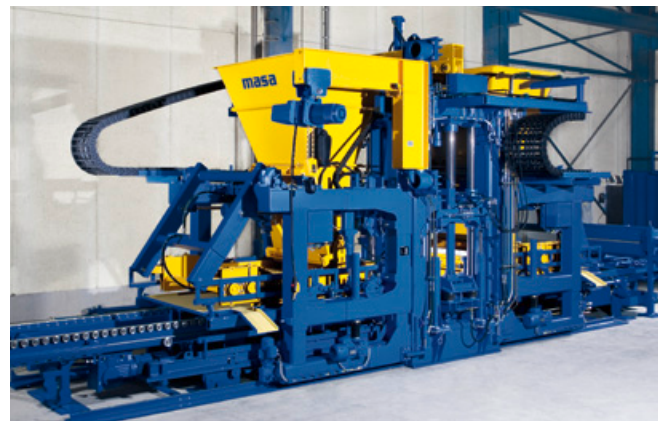
Concrete block making machine