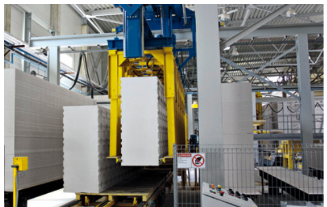
Cubing: Block shifter