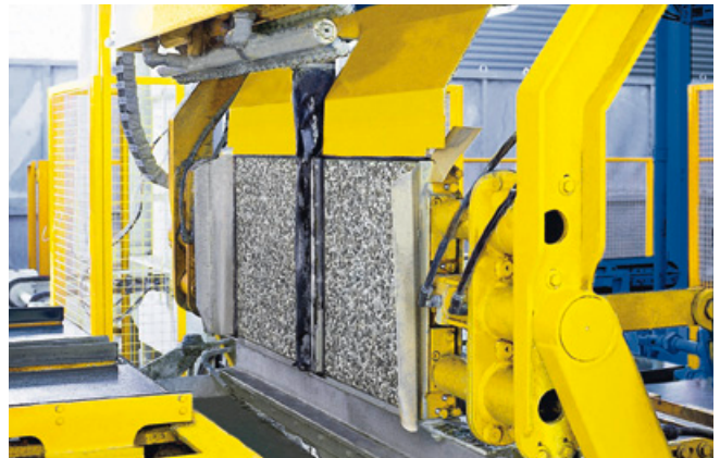
Direct washing device: The natural aggregates are exposed