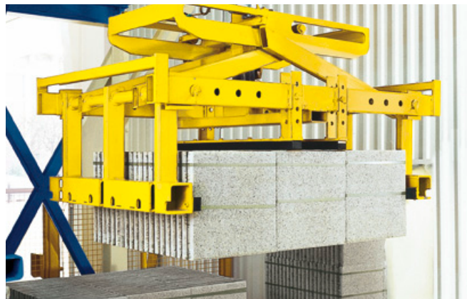
Slab package transfer device