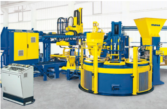
The slab press UNI 2000

The commercial success of each production plant is achieved by careful planning, taking into account the requirements and opportunities available on site for longterm growth from the outset. For this, our designers specify the capacities and lay-outs of equipment, as well as organising the production process. Turn-key plants are assembled with standard components, which can be combined to achieve individual solutions. Utilising standardised components wherever practical results in short delivery times.