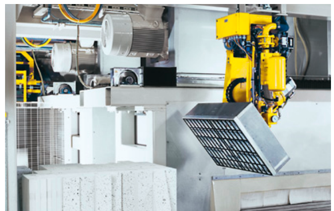
Patented vacuum grab to transport any brick size