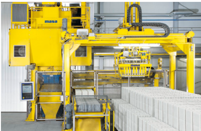
Hydraulic sand lime brick press with brick placing robot for fresh bricks

Our engineers define the machine designs and capacities as well as the process sequence and arrange the plant components in the given space. Complete turn-key plants are assembled from a selection of standard components that can be integrated into the customer's required solution. This modular system ensures correct interpretation of the customer's requirements within a short delivery time.