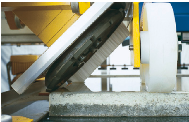
Chamfer grinding: Exact contours