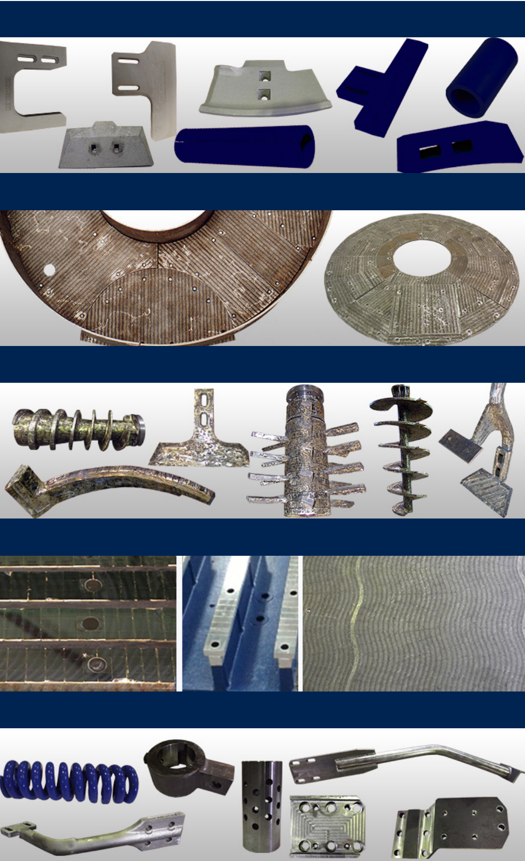
Range of Products